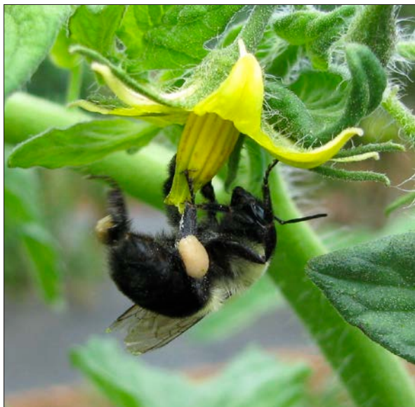
Figure 1 Common eastern bumble bee pollinating a tomato